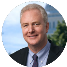
The Honorable Chris Van Hollen

President & CEO Montgomery County Chamber of Commerce