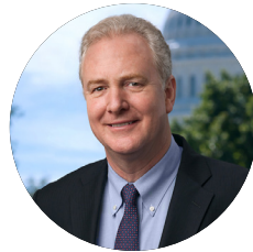
The Honorable Chris Van Hollen

President & CEO Montgomery County Chamber of Commerce