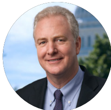
The Honorable Chris Van Hollen

President & CEO Montgomery County Chamber of Commerce