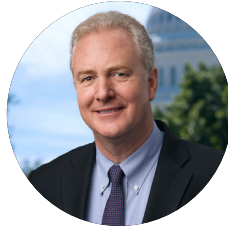
The Honorable Chris Van Hollen

President & CEO Montgomery County Chamber of Commerce